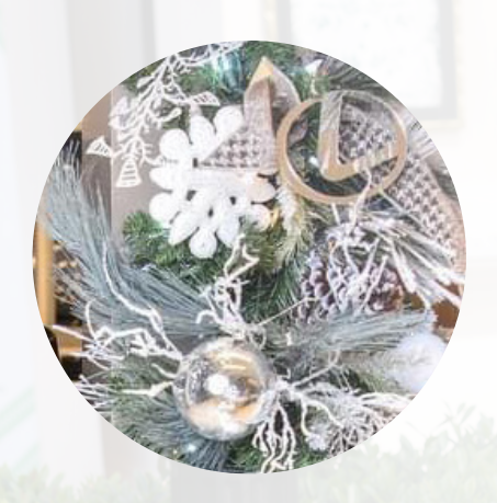
SEASONAL Quotes available upon request

In addition to our extensive planning and design services, we also offer a range of other services to complement and elevate your experience.