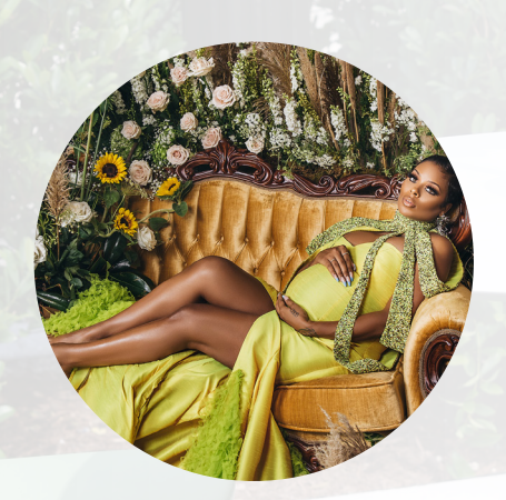
SET DESIGN $1,500 minimum investment