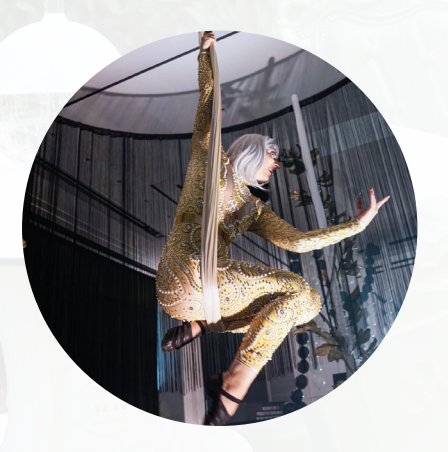
ARTIST PROCUREMENT Quotes available upon request