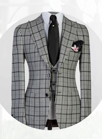
STYLING $2000 minimum investment