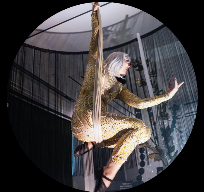
ARTIST PROCUREMENT and MANAGEMENT